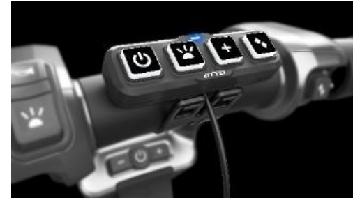
Advanced Shabbat command mechanism, developed in collaboration with the Tzomet Institute.