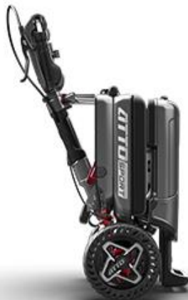
Can be moved along like a trolley