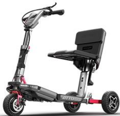
Ready to go in seconds

When revolutionary design meets unmatched usability and comfort