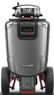
Folded, it's the size of small suitcase