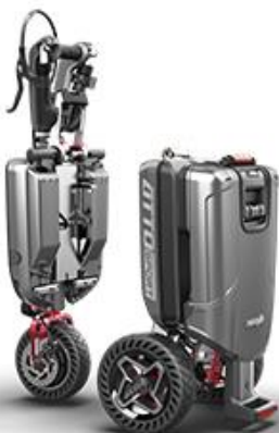
Splits into 2 lightweight parts